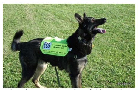
Photos of canine inspection at a storm drain on a beach, example of a passive alert (sit), and an aggressive alert (bark).

When investigating a manhole, catch basin, curb inlets, or other storm drain structures, assisting personnel opening or peering into the structure are asked not to comment or react to condition of structure prior to the canine sniffing to eliminate the handler's possible influence on the canine's investigation. In addition ECS handlers will not look into the structure prior to allowing their canine to sniff.