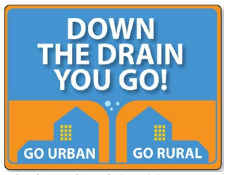
On the MWSP website, visitors can play games such as "Down the Drain you Go" to learn about how their choices affect water quality.

In 2015 we continued promotional efforts in order to expand usage and awareness of the site. This year's efforts resulted in an increase of over 10,000 people visiting the site, 28,997 visitors as of October 31, 2015. Since the MWSP website launched in 2011, a grand total of 71,817 people worldwide have used the site, with every state in the U.S. participating. One of the most popular features of the site is the Virtual