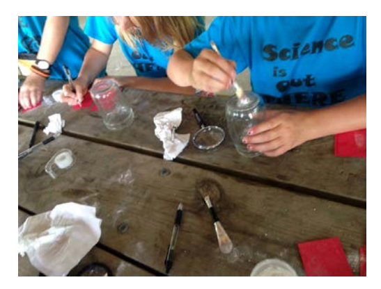
Science Camp Attendees learn about fingerprinting

This year ECD staff used a Stream Table for their presentation. The stream table was a great addition to the program, the kids were able to learn, make predictions, and adapt their river design. Each of our 8 education sessions lasted 40 minutes. We started by talking about soil types, erosion, and deposition and students felt loam, clay and sandy soil samples. We ran three cycles of the stream table – one with directions to work as a team and create a river, the second round we talked about where erosion had occurred and how to prevent it, and the third round we tried to slow down the river as much as we could (meanderings, dams, structures). This was especially timely because it took place a few days following the large rainfall storm on June 22nd. We talked about culverts, flow capacity, and roads washing out.