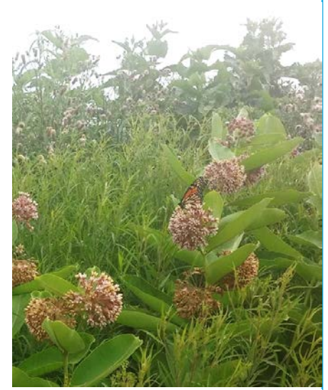
Monarch Butterfly enjoying the native plants at AL!VE

ECD partners on several community wildflower plantings, including: Maple Valley Conservation Area, Charlotte Raingarden, AL!VE's PRESERVE project, General Motors LDT Garden, and more. These sites serve to increase pollinator habitat, protect water quality, and be demonstration sites for landowners. This spring, AL!VE worked with ECD and the Charlotte Fire Department to conduct a prescribed burn on the habitat. This was used as a training exercise for the Fire Department. AL!VE also developed walking trails with educational signage to encourage people to stroll through the habitat.