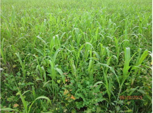
Same planting five weeks later. This is a mix of Sorghum/sudan grass, tillage radish and buckwheat