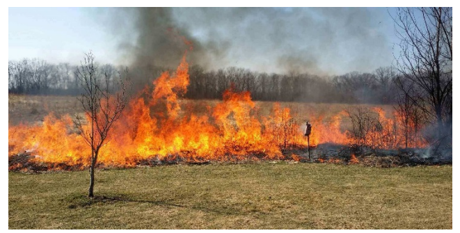
Prescribed burns are one way to increase habitat value. This site is a warm season prairie that is burned regularly to remove invasive species and woody plants.

ECD continued the partnership with the Department of Natural Resources (DNR) to assist landowners in the Hunter Access Program (HAP) and monitor the contract agreements. This provides hunting access to the public and provides a rental payment to the landowner. The two HAP sites in Eaton County have reverted to private rental contracts. We are currently seeking new enrollments for this program. Depending on habitat quality and types of hunting allowed, the program pays up to $25/acre enrolled in the program.