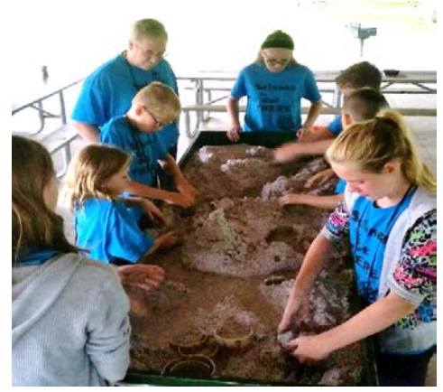
Students design their river