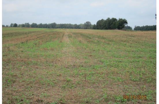
Cover Crop Planting in Benton Twp one week after planting. Cover Crops help manage soil fertility, soil quality, erosion, pests, weeds, biodiversity, and wildlife

The commonly used programs available are the Environmental Quality Incentives Program (EQIP), Conservation Stewardship Program (CSP) and the Agricultural Conservation Easement Program (ACEP). Having a Conservation Plan developed is the first step to then determine what programs are available to help implement and follow the plan. Stop in to get more information on how one of these programs may benefit your farm.