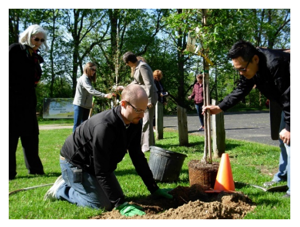
Getting down and dirty. MSUFCU helps plant trees through the Go Green Challenge Partnership

Another major component of the Arbor Day program is tree plantings. We accomplish this through our Go Green Youth Challenge Tree Planting Grant program as well as additional sponsorships and partnerships. This year, we were able to complete four community tree plantings totaling 85 trees. Hartland Township and Grand Ledge High School were awarded Go Green Youth Challenge Tree Planting Grants for $2,000 each. Hartland Twp. will use this grant to plant trees in a newly created public park, while Grand Ledge High School will use it to create a windbreak to shield their athletic fields. The other two tree plantings were carried out with help from Michigan State University Federal Credit Union (MSUFCU). MSUFCU has donated both time and money toward planting trees in the mid-Michigan area since 2011. This spring we planted nine sargent crabapples in Nancy Moore Park in Meridian Township and eight red maples in Maple Grove Cemetery in Mason. We would like to thank all of the volunteers from MSUFCU who helped make these plantings possible.